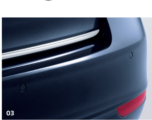
<sup>1</sup>Accessories must be dealer installed and approved by Volkswagen Finance. Certain conditions may apply. Contact your approved dealer for full details. <sup>1</sup>Limited warranty is supplied by Volkswagen Group Canada Inc.