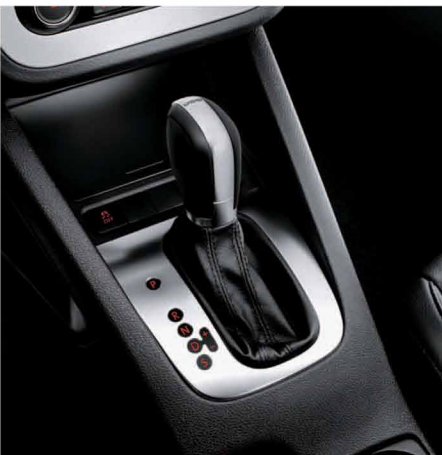
6-speed Automatic DSG with Tiptronic® Shifts gears seamlessly in 4/100ths of a second. Or quite literally in the blink of an eye.