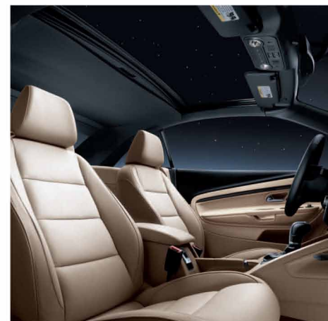
Coupe-Sunroof-Convertible (CSC) automatic folding hardtop Go from coupe to convertible in 25 seconds flat.