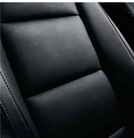
Leather sport seats To keep you comfortable and in control while driving, side-bolstered leather seats support the contours of your body.