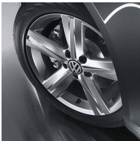
17" alloy wheels Cast your eyes on these 17" alloy wheels. Careful, though – you might not be able to look away.