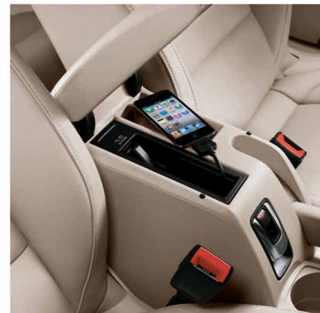
Media Device Interface (MDI) with iPod® adaptor Plug in your iPod® and cruise the open road with all your favourite tunes.