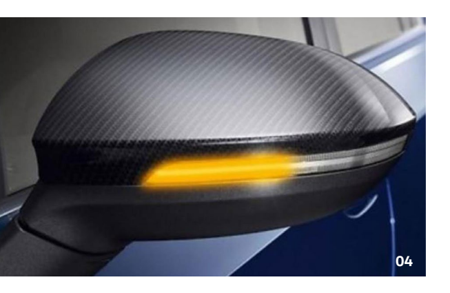
<sup>†</sup>Accessories must be dealer installed and approved by Volkswagen Finance. Certain conditions may apply. Contact your approved dealer for full details. <sup>‡</sup>Limited warranty is supplied by Volkswagen Group Canada Inc.