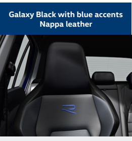
Paint & upholstery -